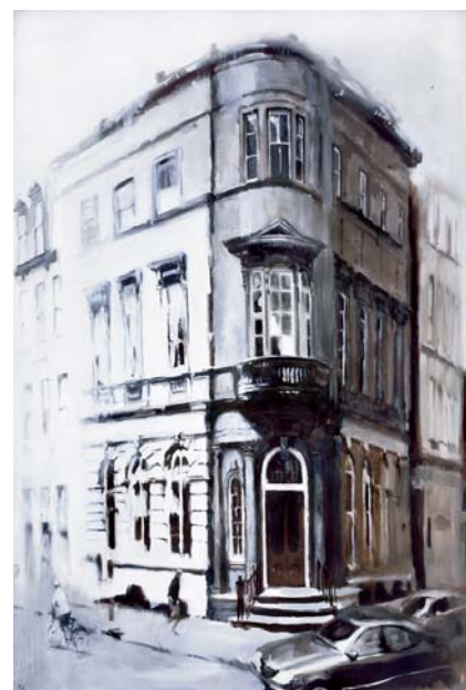
JOSHUA FLINT, LEGACY, OIL ON PANEL, 36 X 24"