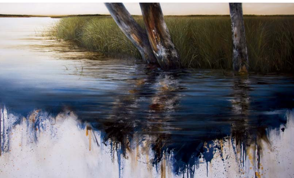
CHARLES WILLIAMS, MIRRORED SOULS, OIL ON CANVAS, 36 X 60"