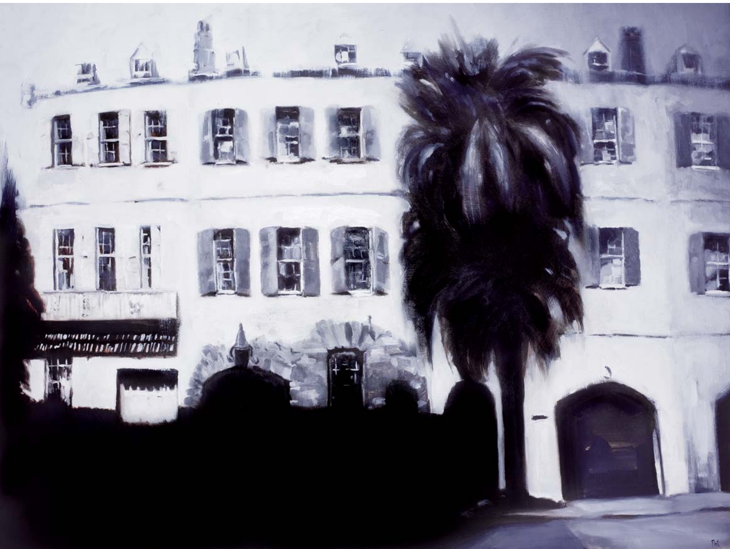
JOSHUA FLINT, HOMAGE, OIL ON PANEL, 18 X 24"