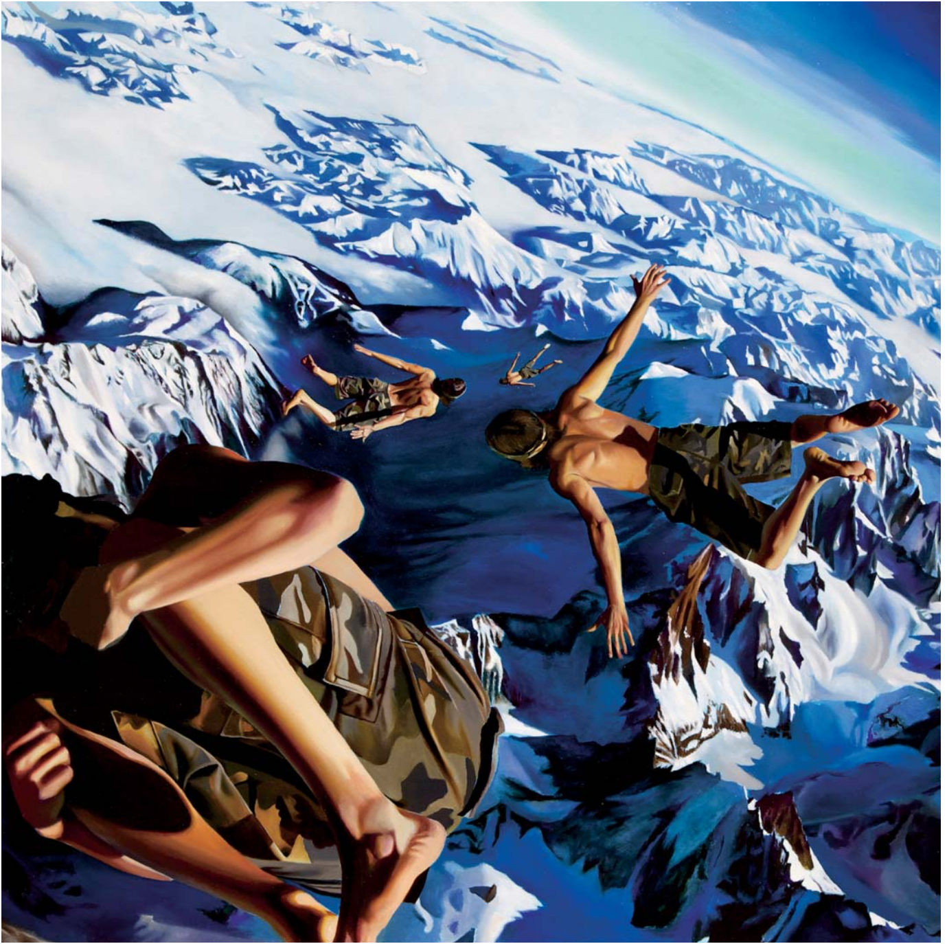
GO, OIL ON PANEL, 36 X 36"