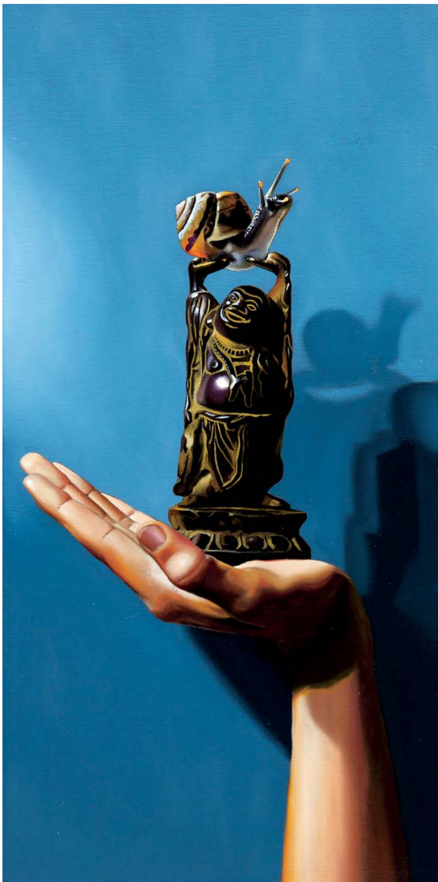
DIFFERENT KIND OF LOVE, OIL ON LINEN, 10 X 20"