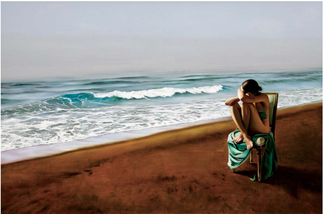
MORE THAN THIS, OIL ON WRAPPED PANEL, 18 X 27"