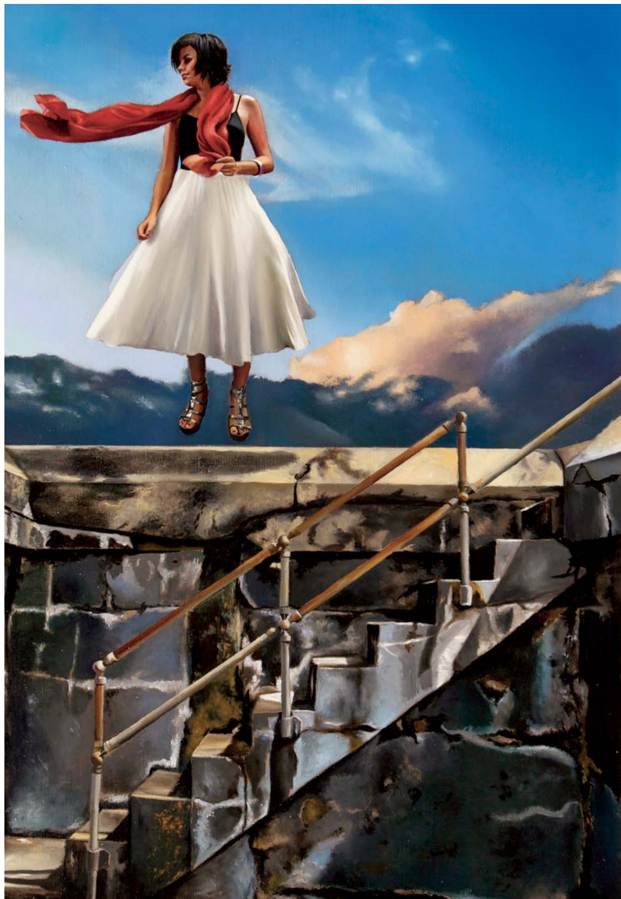
COMING UP, OIL ON LINEN, 14 X 21"